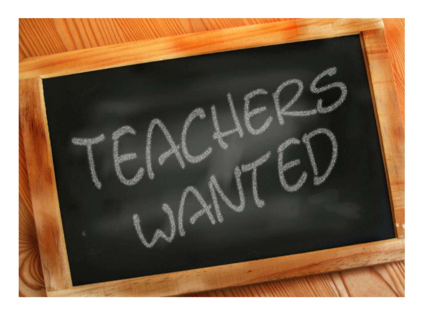
As long as there are children, there will be a need for teachers.

As long as there are children in the world there will always be a demand for teachers. In the state of Oregon, teaching jobs are particularly needed and expected to experience growth. In fact, Oregon ranks 9th out of the top 10 states expected to see growth for teaching jobs from 2012-2022. Oregon's annual teaching job growth is increasing at a rate of 9.9%, with nearly 5,000 job openings per year. A teacher's salary, or annual earnings, can range from approximately $35,000 to $85,000 per year. Teachers can earn more if they decide to take on additional leadership positions, like becoming an administrator, or principal. Additional special endorsements in Literacy or English as a second language, could also increase a teacher's income. Advancement in the field of education usually requires more training and school.