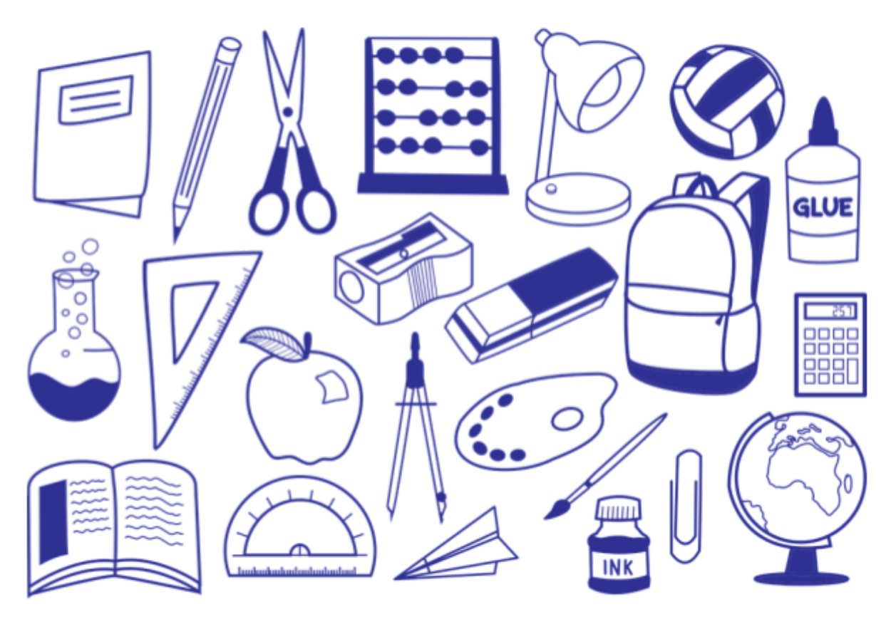
A teacher needs to know about many different subjects in order to help students understand.

Most people have been a student and have had several teachers throughout their lives, but, what does a teacher actually do? Educators help children understand general school subjects like reading, writing, math, science, social studies and much more. Teachers also help students learn study habits, practice social skills and how to use technology. When I become a teacher I think I will spend a lot of time developing and planning lessons about curriculum, or subjects of study, to help students understand and practice different topics and skills. As a teacher I will need to be able to deliver instruction in a clear way and to answer questions students may have. Teachers also have to grade a lot of student work. They have to analyze the assignments and scores to determine grades.