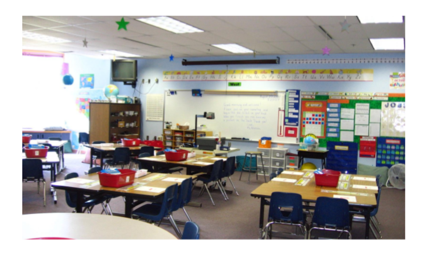
A teacher's classroom is their home away from home.

If you guessed you would find a teacher working in a school you would be right. Most traditional school buildings consist of numerous classrooms for different ages and grades. A teacher spends most of their time in their own classroom. However, they may also utilize other learning spaces such as a library, playground, or computer lab. Occasionally teachers take their classes on field trips out into the community and do their teaching on the go. Within the teaching environment educators need to be comfortable using several tools to enhance their instruction. Technology, including computers, iPads, document cameras, projectors, apps, internet, email and software programs are used frequently. While much of a teacher's time is spent with students or planning individually, perhaps the most valuable resource teachers have is time spent collaborating with other teachers on grade level teams and school committees.