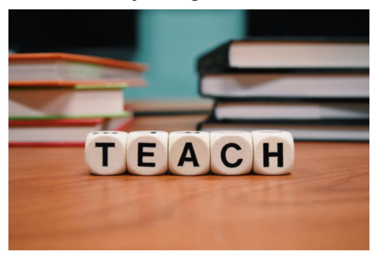
"To teach is to touch a life forever." -Anonymous